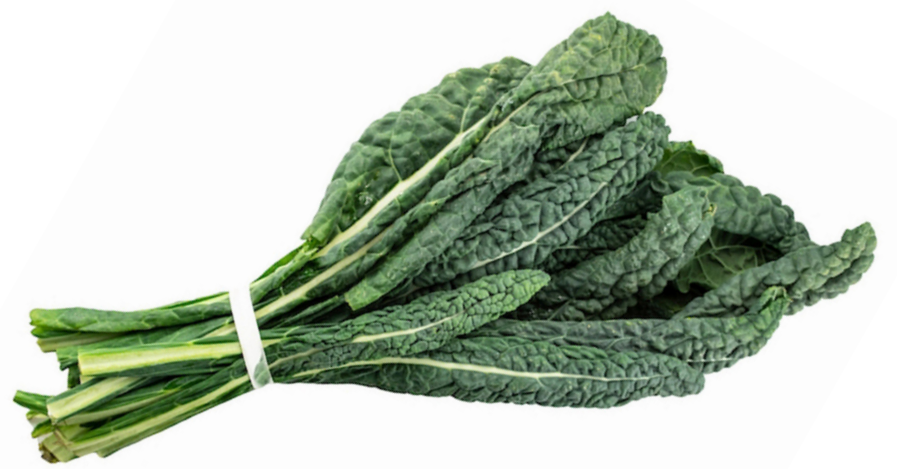
Organic Lacinato Kale USA