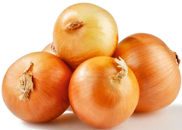
Organic Yellow Onions 3# Bags USA