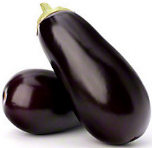
Organic Eggplant USA