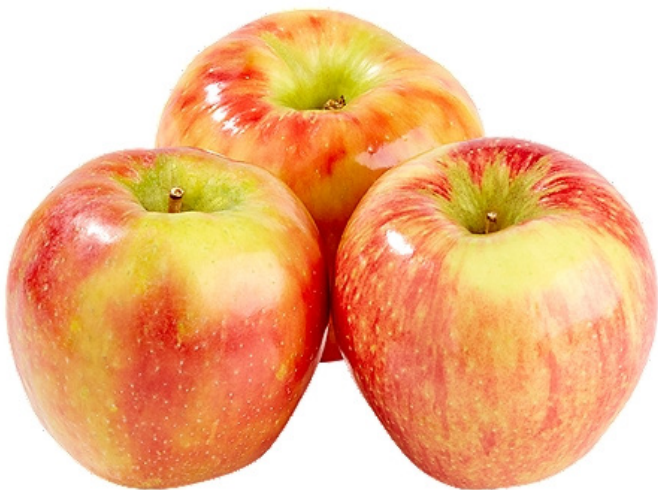
Organic Honeycrisp Apples USA