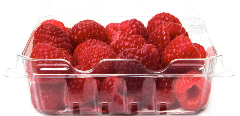
Organic Raspberries 1/2 pint Mexico