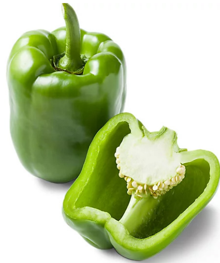
Organic Green Bell Peppers Mexico